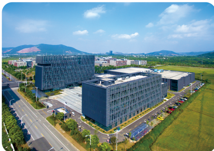
State-of-the-art manufacturing facilities.

That way we know we will be able to deliver the highest quality products to the medical profession both today and way into the future.