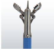
ALLIGATOR CUP W/ NEEDLE