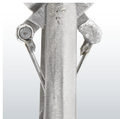
TWIN WIRE JAW DESIGN