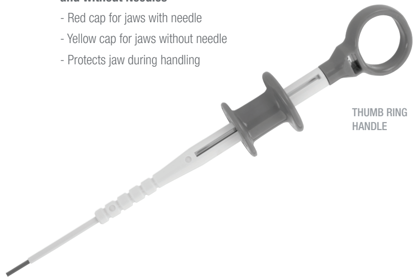
THUMB RING HANDLE