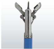
OVAL CUP W/NEEDLE