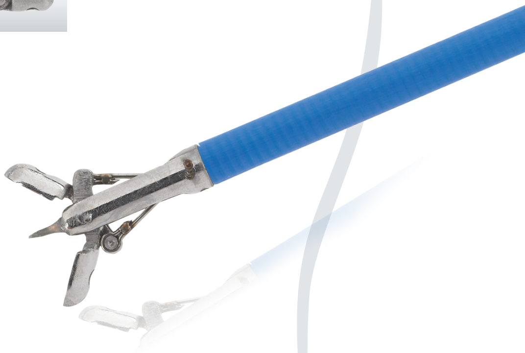
PRECISOR® EXL BIOPSY FORCEP