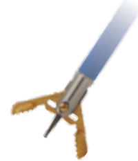
ALLIGATOR CUP WITH NEEDLE