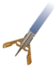
OVAL CUP WITH NEEDLE